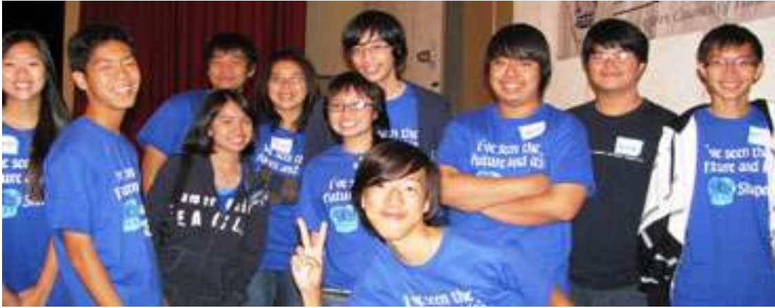
Moanalua High School PAAC Club at WorldQuest