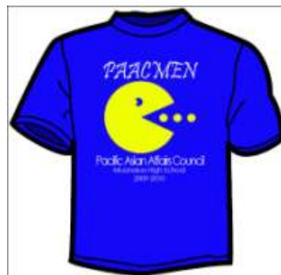
PAAC Shirt Design (Back)