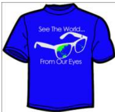
PAAC Shirt Design (front)