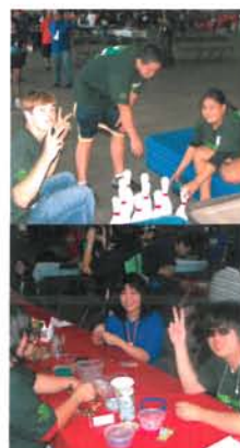
Top: Students set up bowling game for participants. Above: At arts & crafts table.