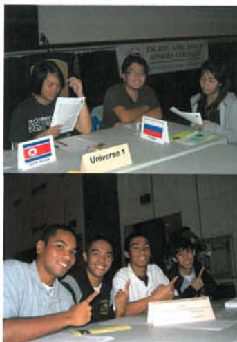
Above: Students prepare for Six-Party Talks simulation and Academic WorldQuest. Top Left: Students with Fall Conference banner.

Mahalo to our event sponsors: Chevron, USA, The Freeman Foundation, Friends of Hawaii Charities, Hawai'i State Department of Education, McInerney Foundation, Na Lei Aloha Foundation, Radford Learning Center, and the University of Hawai'i at Manoa Department of Educational Foundations.