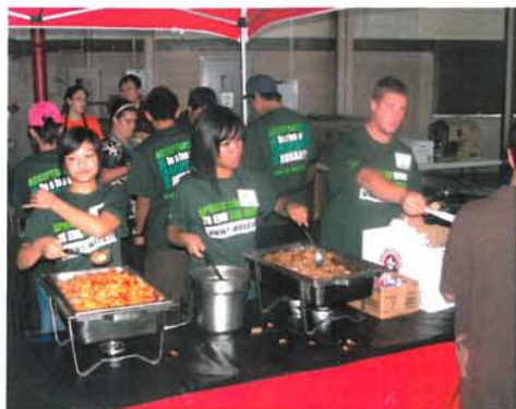
Students serve lunch to Special Olympics participants and their families and friends.

PAAC After-School Classes at Roosevelt, Kaimuki, and Radford High Schools participated in the 2009 Holiday Classic for the Special Olympics Hawai'i. The event took place at Hickam Air Force Base at Hanger 34/35. The hangers were decorated and transformed into Olympic Town; a place where athletes can participate in arts & crafts, and games before the opening ceremonies.